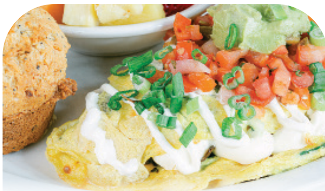
Surfer Girl Omelet

Add Fresh Blueberry or Everything Muffin 2.49