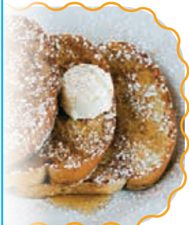
Classic French Toast