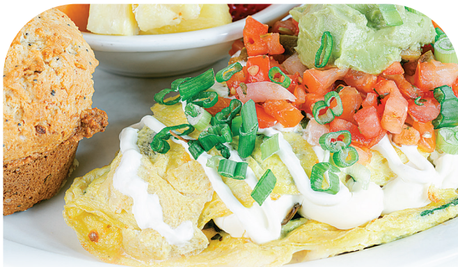
Surfer Girl Omelet

Add Fresh Blueberry or Everything Muffin 2.49